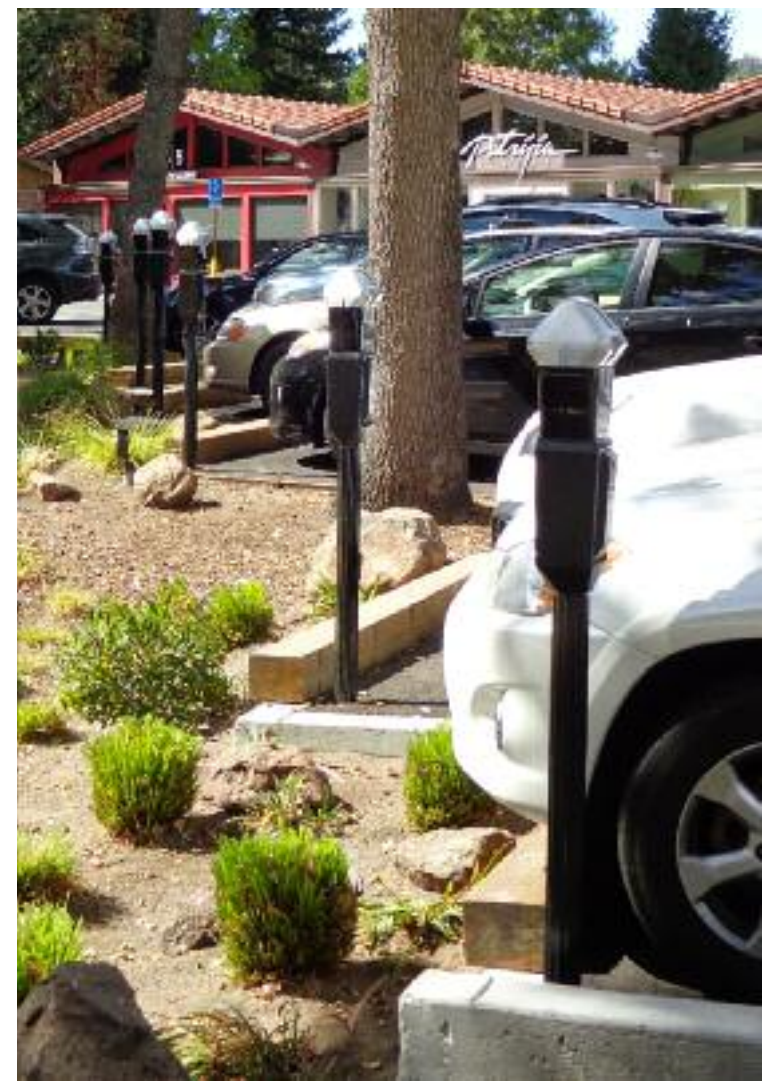
On a sunny Thursday, parking spots at La Fiesta Square were available for customers; more meters may be coming to privately owned parking lots in

To see the entire report, go to www.lovelafayette.org, click on public meetings and go to the City Council staff report for the Sept. 28 meeting.